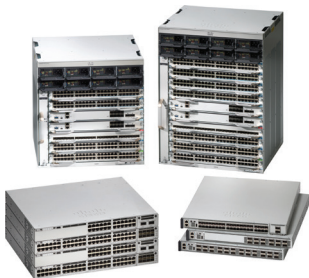
Cisco Nexus 9000 and 3000 Switches