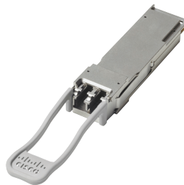
Cisco BiDi Dual-Rate Transceiver